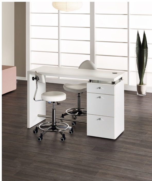
IN PHOTO: MB/MT015

Le immagini sono fornite al solo scopo illustrativo e non costituiscono elemento contrattuale